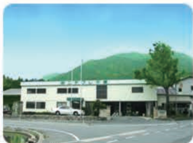
• Nichifule Chigusa Corporation