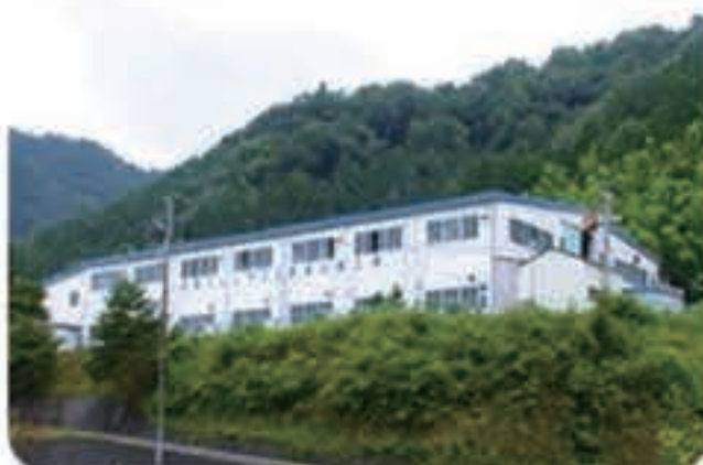
• Yamasaki Factory