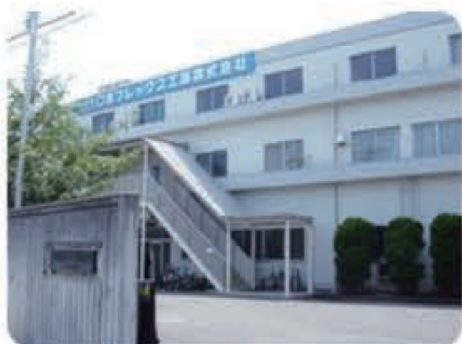
• Head office and Itami Factory