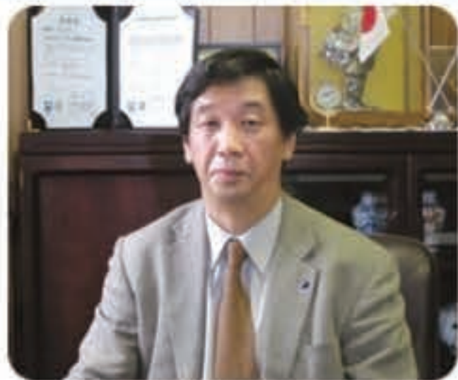
NIPPON flex controls® President

We hope to contribute to society by offering high quality products featuring all requisite functions by relying on our corporate ideal and by doing what we know best.