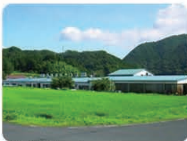
• Nichifule Shimane Corporation